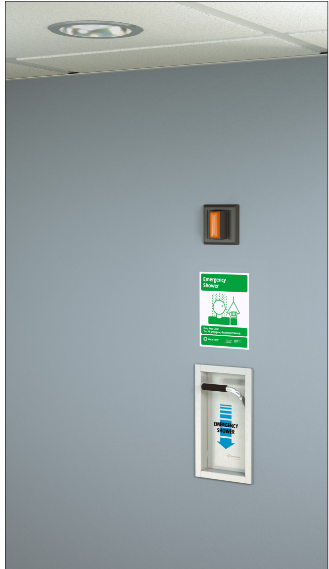
Note: Shown with optional AP280-235 electric light and alarm horn unit (sold separately).