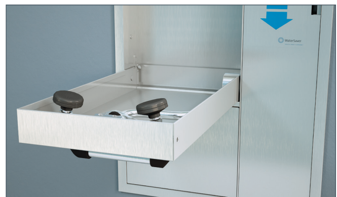
Note: Shown with optional AP280-235 electric light and alarm horn unit (sold separately).