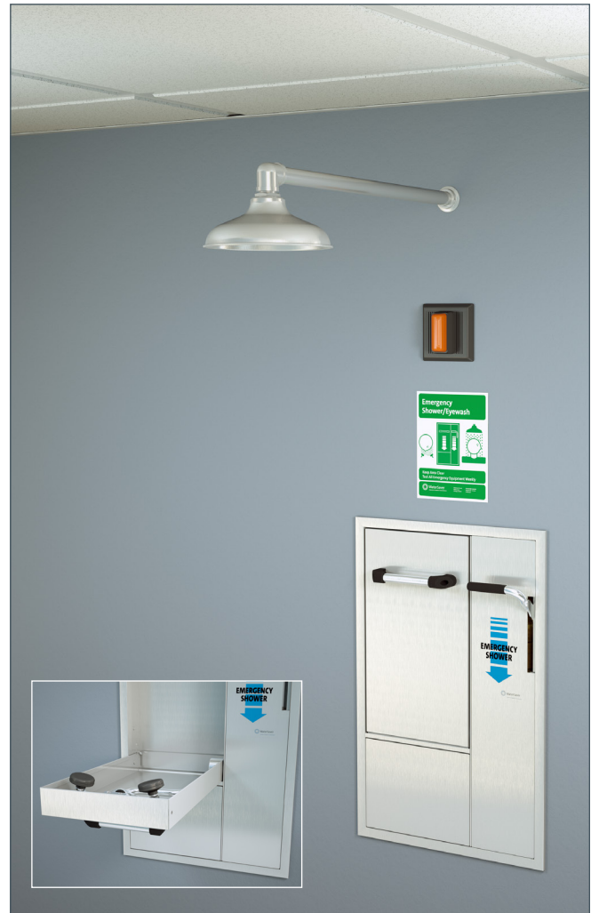
Note: Shown with optional AP280-235 electric light and alarm horn unit (sold separately).