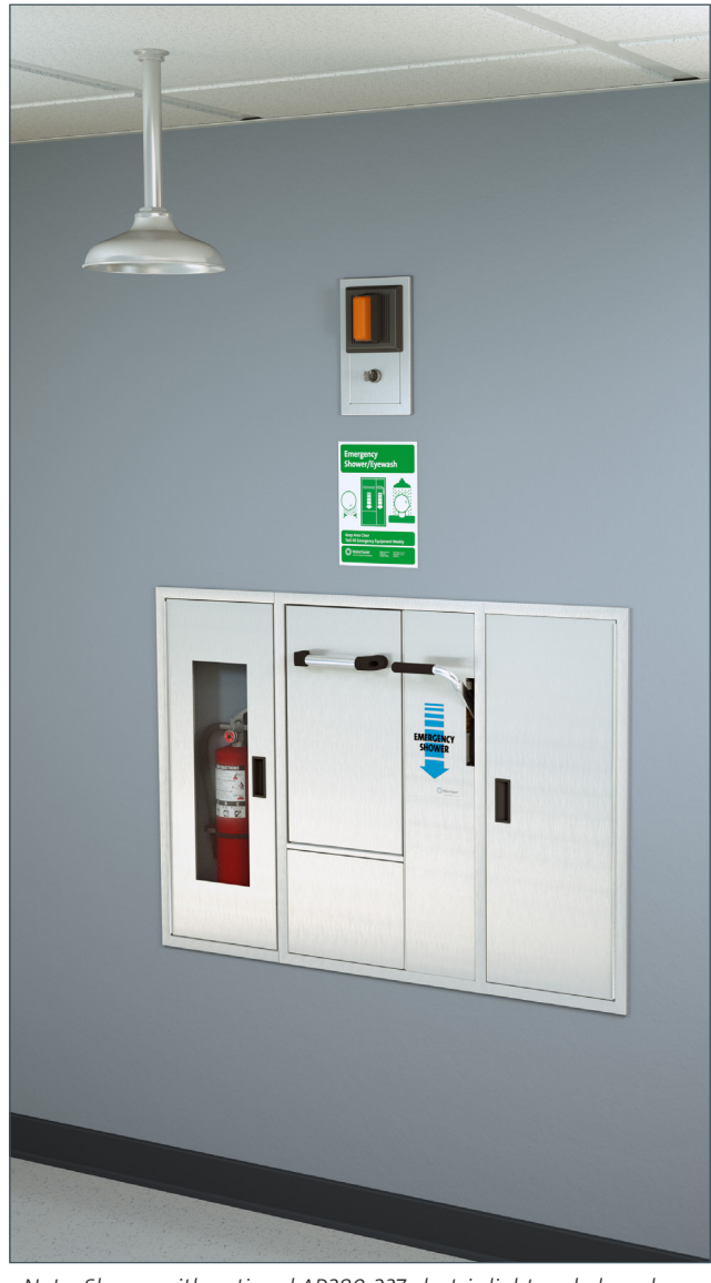
Note: Shown with optional AP280-237 electric light and alarm horn unit with silencing switch. (Fire extinguisher sold separately)