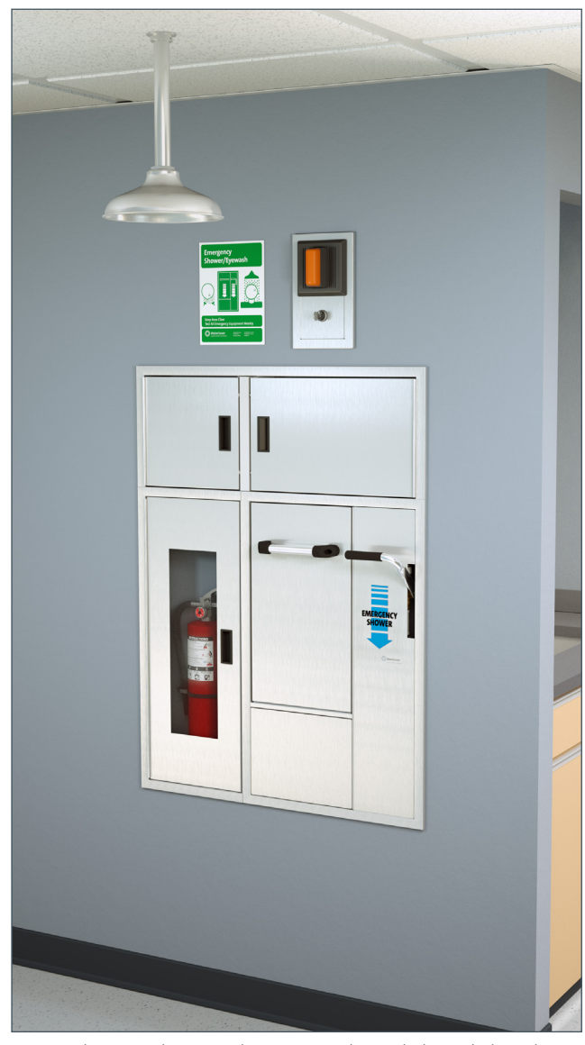
Note: Shown with optional AP280-237 electric light and alarm horn unit with silencing switch. (Fire extinguisher sold separately)

AP250-065 Modesty curtain for wall mounting.