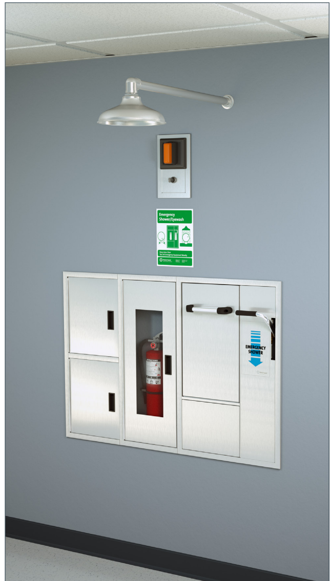
Note: Shown with optional AP280-237 electric light and alarm horn unit with silencing switch. (Fire extinguisher sold separately)