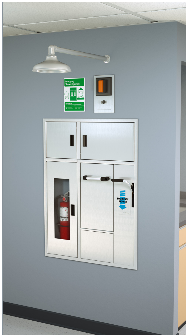
Note: Shown with optional AP280-237 electric light and alarm horn unit with silencing switch. (Fire extinguisher sold separately)