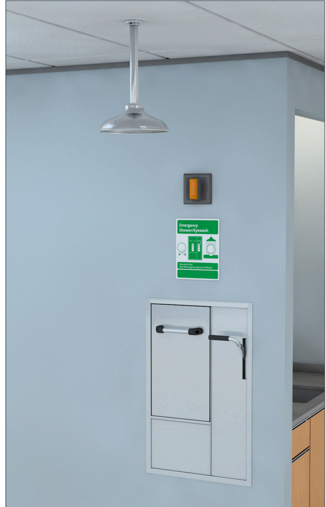
Note: Shown with optional AP280-235 electric light and alarm horn unit (sold separately).