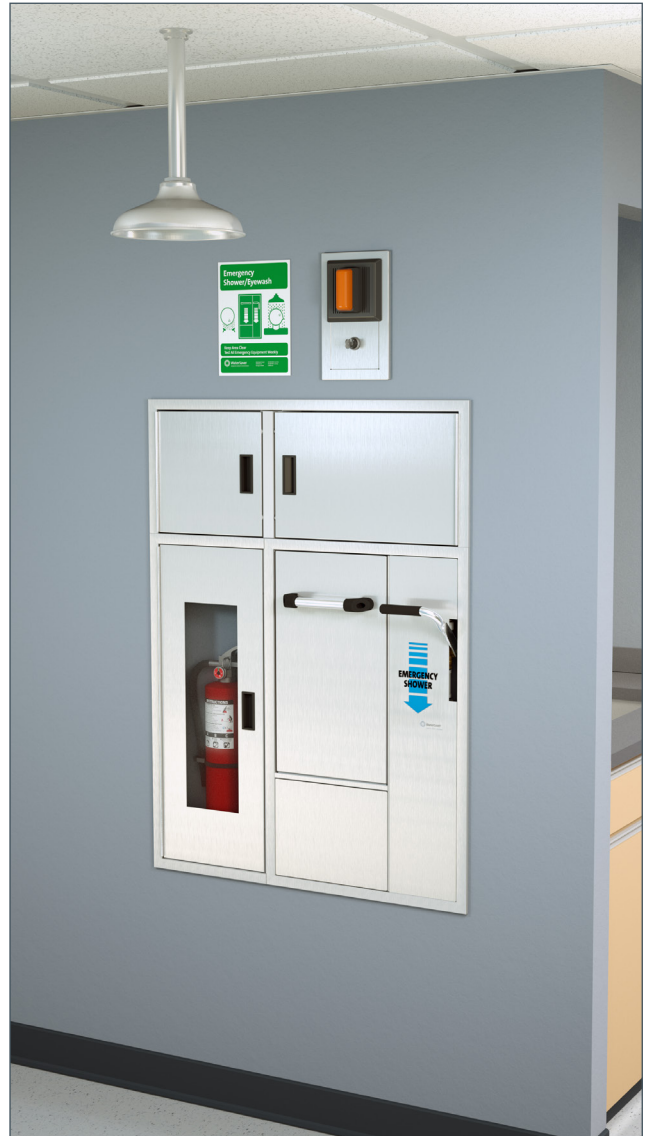
Note: Shown with optional AP280-237 electric light and alarm horn unit for recess mounting in finished wall. (Fire extinguisher sold separately)

AP250-065 Modesty curtain for wall mounting.