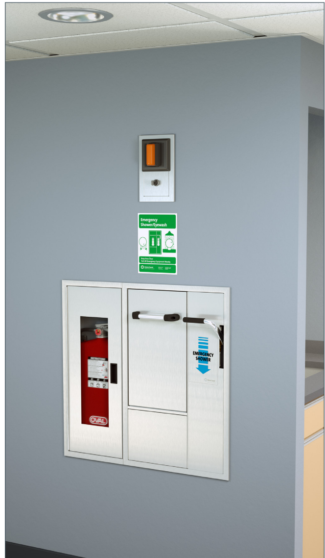
Note: Shown with optional AP280-237 electric light and alarm horn unit with silencing switch. Accommodates Oval fire extinguisher model 10JABC. (Fire extinguisher sold separately)

□ AP250-065 Modesty curtain for wall mounting.