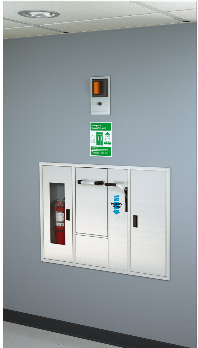
Note: Shown with optional AP280-237 electric light and alarm horn unit with silencing switch. (Fire extinguisher sold separately)