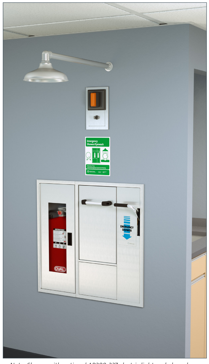
Note: Shown with optional AP280-237 electric light and alarm horn unit with silencing switch. Accommodates Oval fire extinguisher model 10JABC. (Fire extinguisher sold separately)

AP250-065 Modesty curtain for wall mounting.