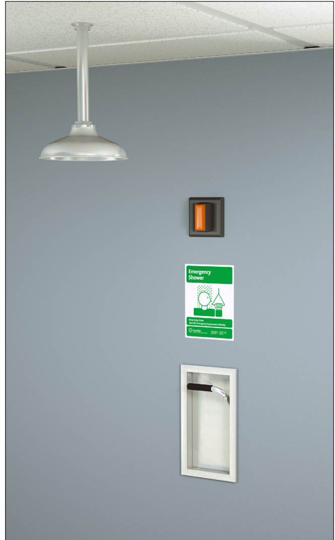
Note: Shown with optional AP280-235 electric light and alarm horn unit (sold separately).