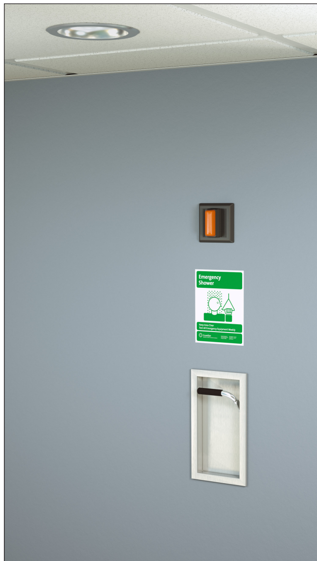
Note: Shown with optional AP280-235 electric light and alarm horn unit (sold separately).