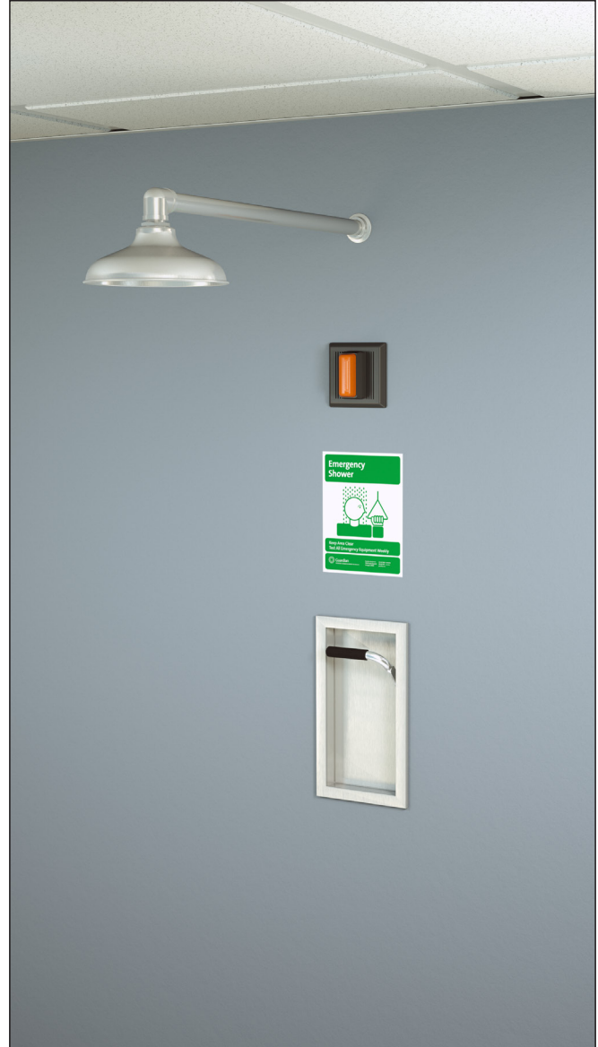
Note: Shown with optional AP280-235 electric light and alarm horn unit (sold separately).