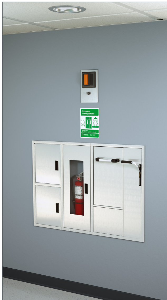
Note: Shown with optional AP280-237 electric light and alarm horn unit with silencing switch. (Fire extinguisher sold separately)

AP250-065 Modesty curtain for wall mounting.