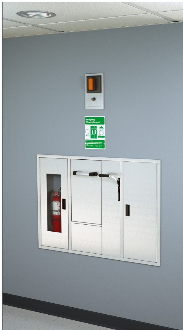
Note: Shown with optional AP280-237 electric light and alarm horn unit with silencing switch. (Fire extinguisher sold separately)