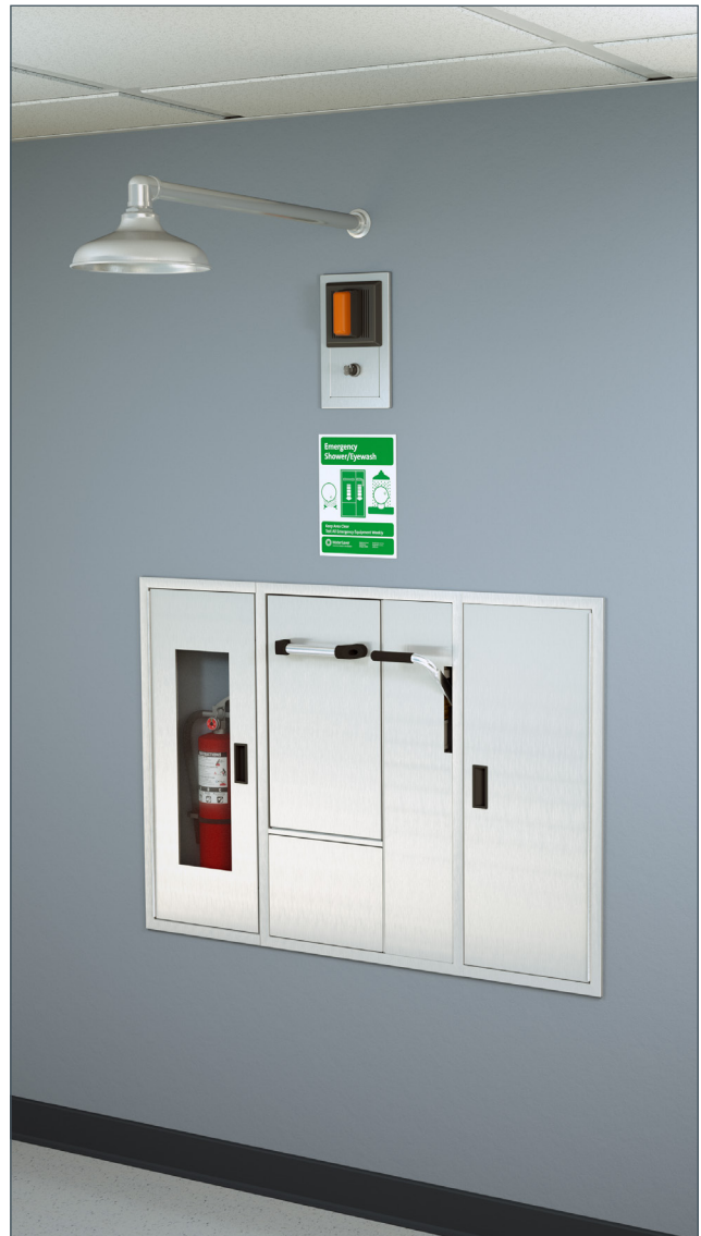
Note: Shown with optional AP280-237 electric light and alarm horn unit with silencing switch. (Fire extinguisher sold separately)